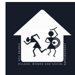
CENTRE FOR VILLAGE, WOMEN & SOCIAL EMPOWERMENT