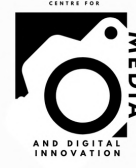
CENTRE FOR MEDIA & DIGITAL INNOVATION