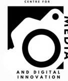
CENTRE FOR MEDIA & DIGITAL INNOVATION