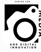
CENTRE FOR MEDIA & DIGITAL INNOVATION