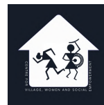
CENTRE FOR VILLAGE, WOMEN & SOCIAL EMPOWERMENT